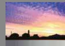
TxLink3 8-bit rendering