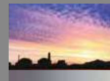
TxLink4 16-bit rendering

The TxLink4 allows simultaneous RIP processing of up to 8 jobs with various print data. (1)