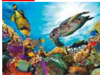
Correct drop landing position and paper feeding ensures the highest print quality