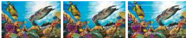
Incorrect bi-directional drop landing position

*DAS may not be compatible with some media such as coloured, transparent, and embossed substrates.